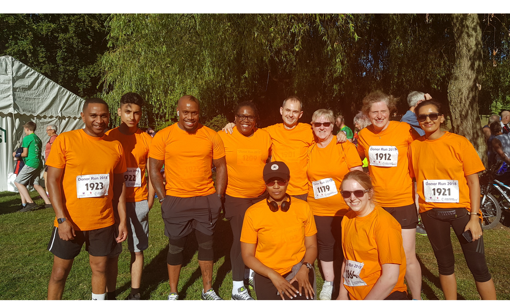
West Midlands Railway staff at the British Transplant Games Donor Run