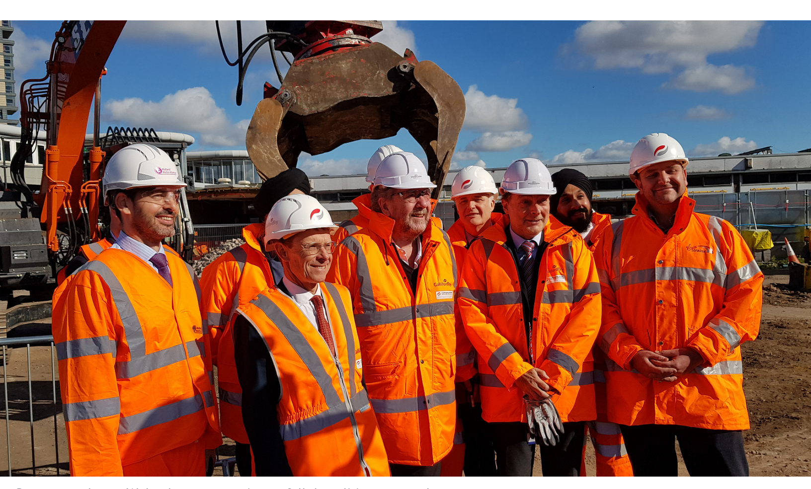
Partners gather at Wolverhampton station as full demolition gets underway